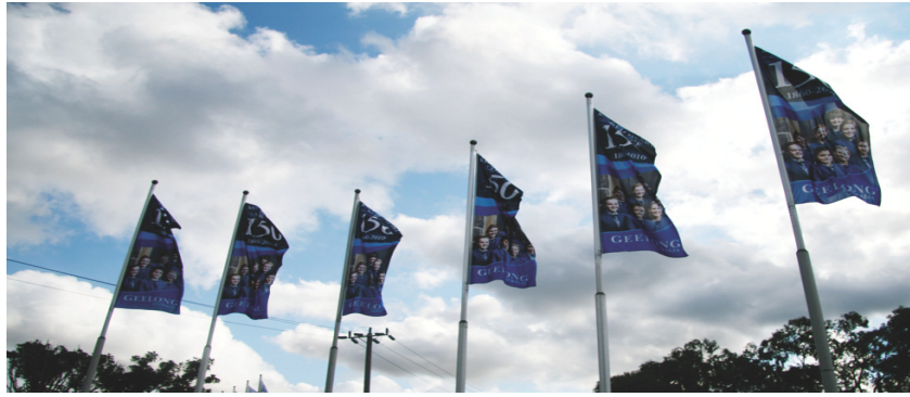
Anniversary flags line the highway into Geelong