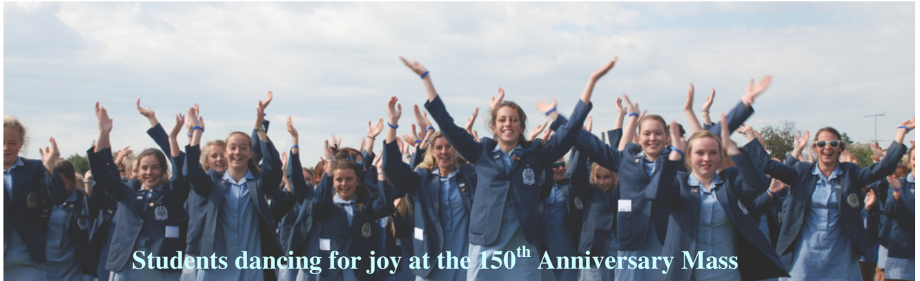
Students dancing for joy at the 150 th Anniversary Mass

Sacred Heart College in Geelong has marked its 150th Anniversary with a year of celebration and thanksgiving. Events have included a community celebration, the largest ever reunion of former students and the publication the school history.