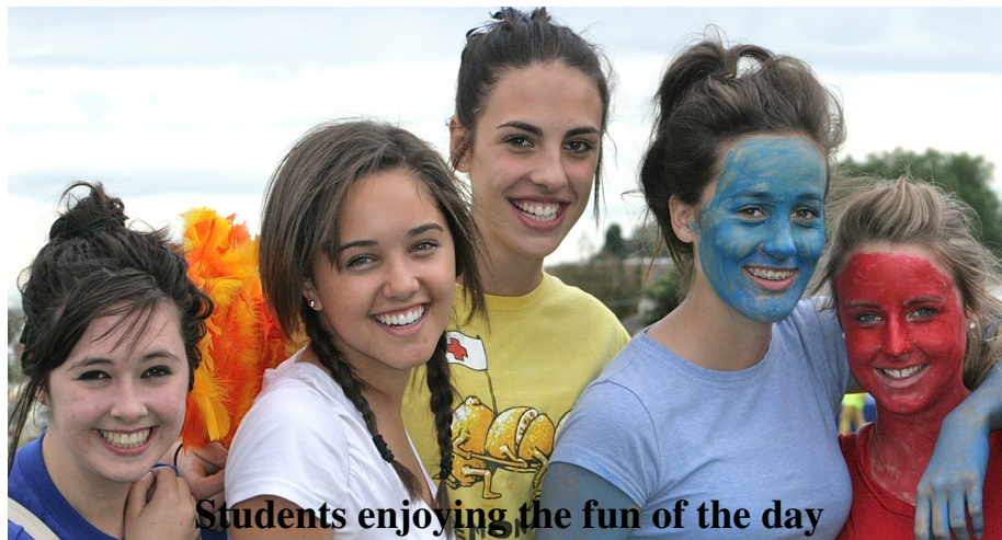
Students enjoying the fun of the day